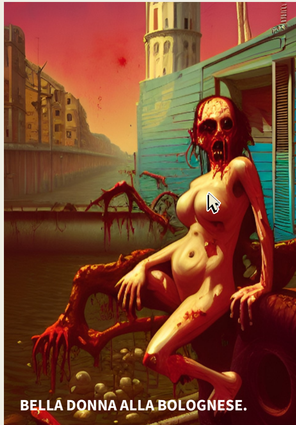
BELLA DONNA ALLA BOLOGNESE.

Even the summer holidays had taken a much more dramatic turn from what we were used to. Instead of fighting for a seat under the front row umbrella, they were fighting for the lump of bread hidden in their swimsuit.