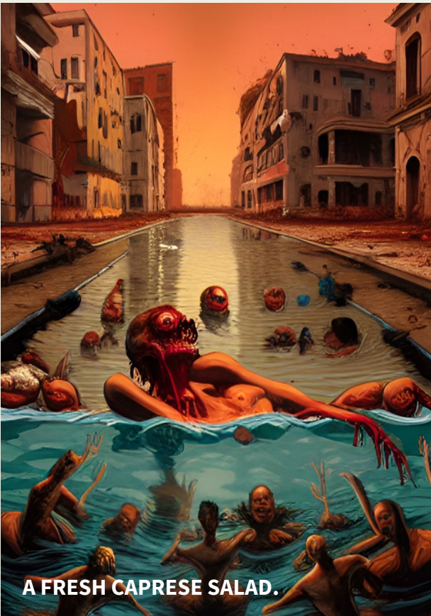
A FRESH CAPRESE SALAD.

Even the summer holidays had taken a much more dramatic turn from what we were used to. Instead of fighting for a seat under the front row umbrella, they were fighting for the lump of bread hidden in their swimsuit.