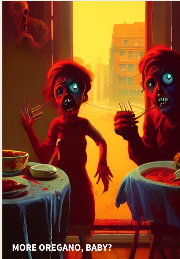
MORE OREGANO, BABY?

Depriving Italians of carbohydrates was one of the cruelest repressions in history. People began to lose their limbs, and even their eyes. They would drag their bleeding bodies to the baker in the neighborhood... ...to kill him.