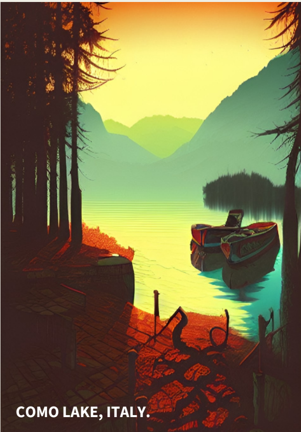
COMO LAKE, ITALY.

At the time when the events we are about to tell happened, Italy was no longer a happy place to spend the holidays and something very dark was shaking the pasta-eating population.