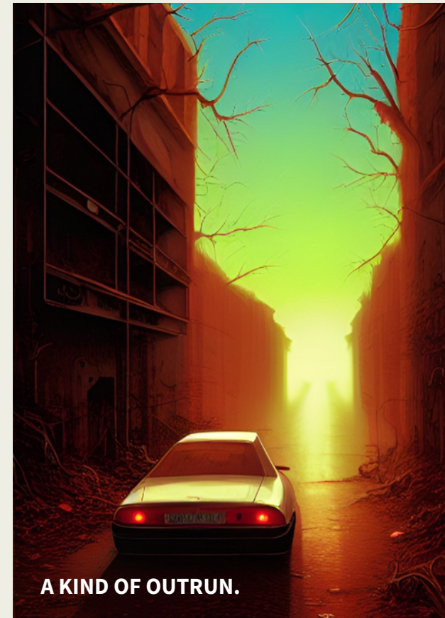
A KIND OF OUTRUN.

The boot-shaped peninsula was experiencing one of the deepest and darkest periods of economic, health and cultural decay.