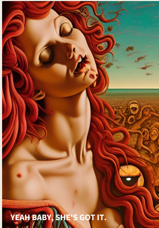
YEAH BABY, SHE'S GOT IT.

At the time when the events we are about to tell happened, Italy was no longer a happy place to spend the holidays and something very dark was shaking the pasta-eating population.