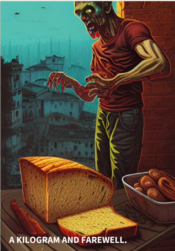
A KILOGRAM AND FAREWELL.

Depriving Italians of carbohydrates was one of the cruelest repressions in history. People began to lose their limbs, and even their eyes. They would drag their bleeding bodies to the baker in the neighborhood... ...to kill him.